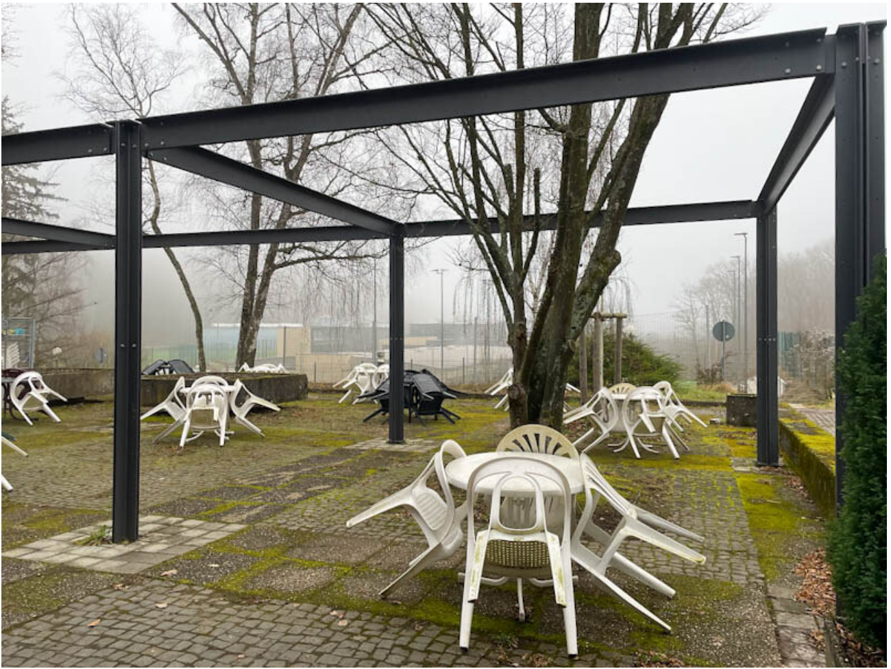
Exterior view of the terrace of Philo Café