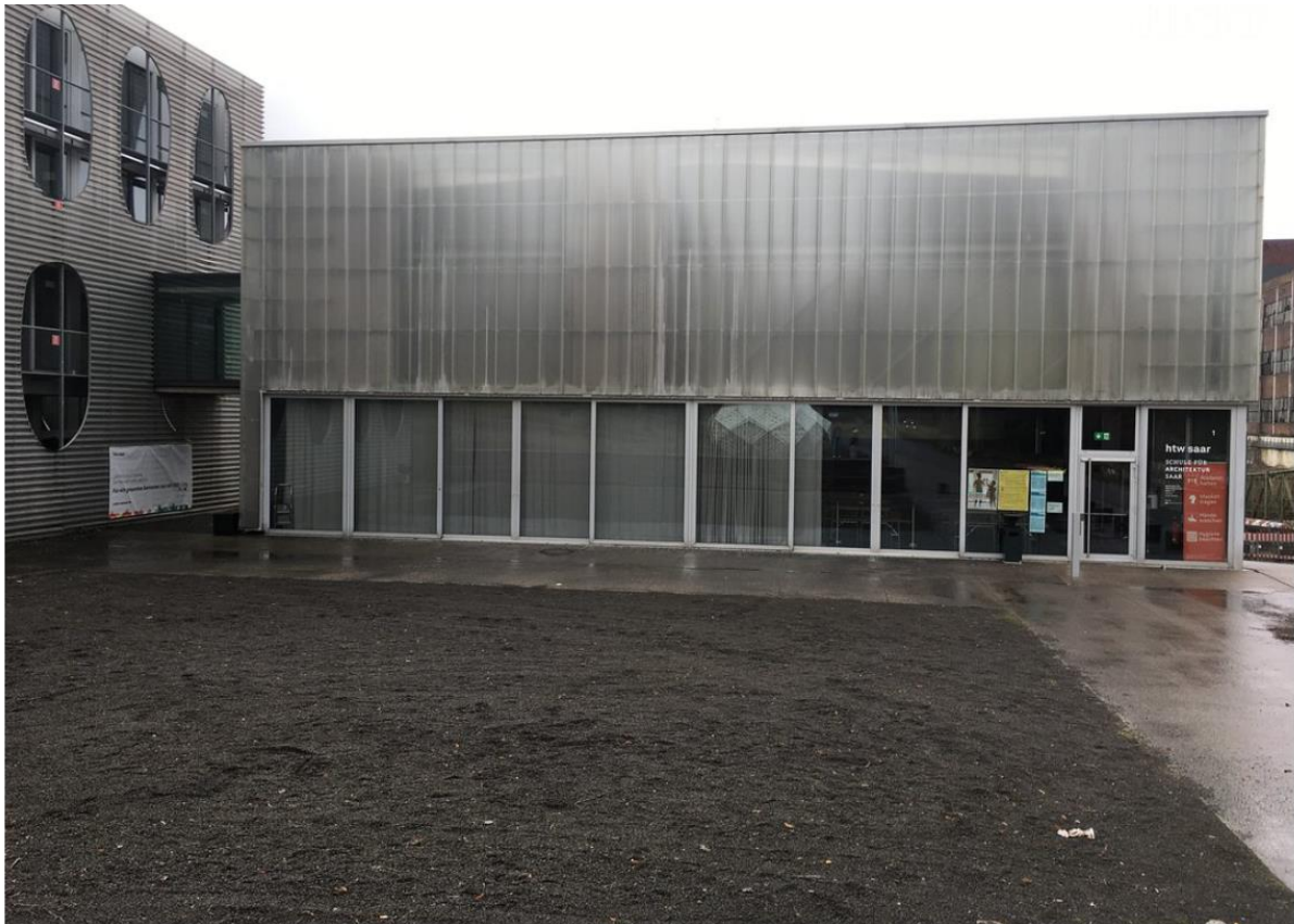
the building of the refectory Göttelborn from the front

In the modern ambience of the refectory on the Göttelborn campus, a vegetarian menu and a full menu are available to guests every day from Monday to Friday.