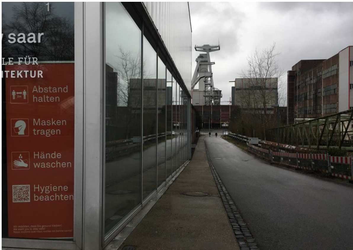
the Mensa Göttelborn has large windows that offer a panoramic view of the campus