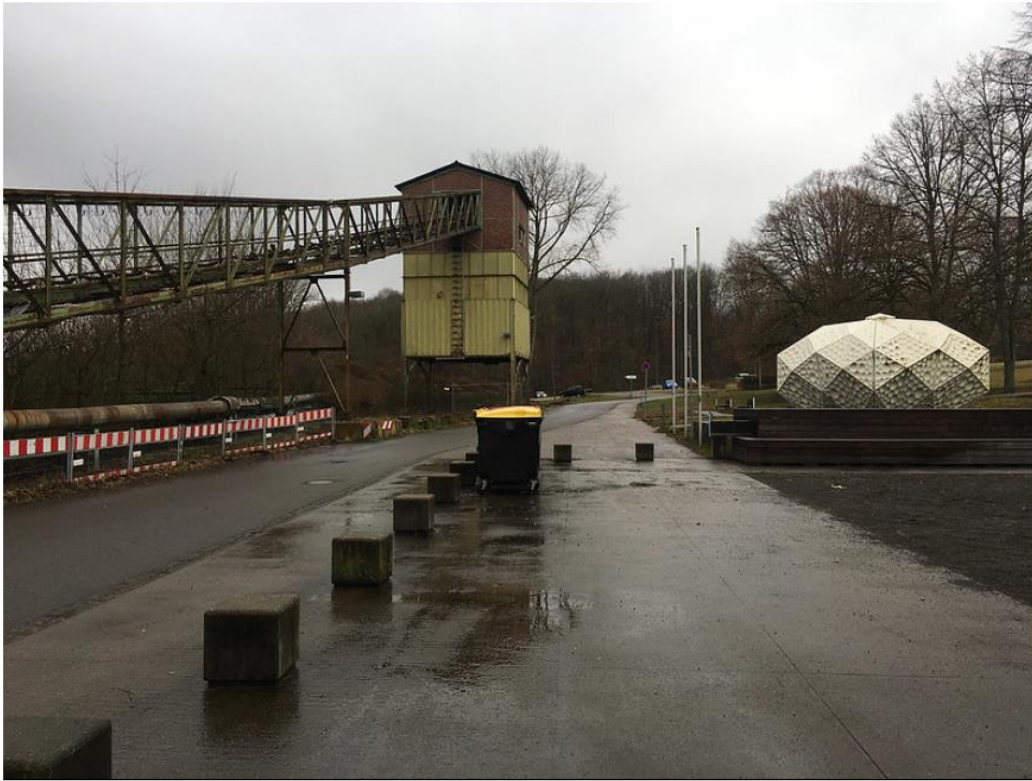
View of the Göttelborn campus from the glass windows of the refectory