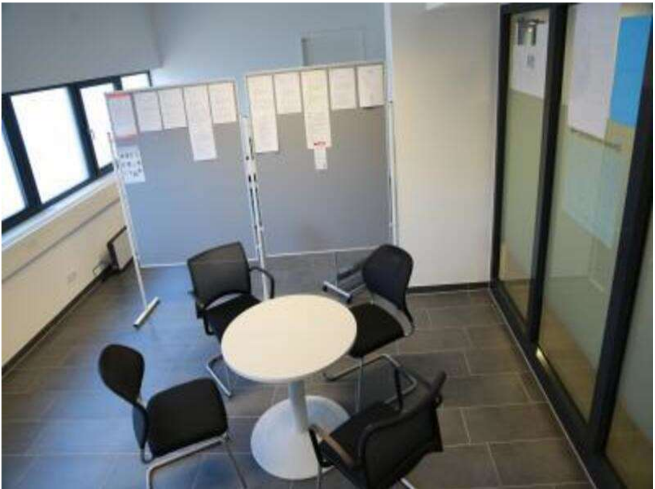
Consulting room from the inside

The consultation room has several time slots in which different consultations are offered.