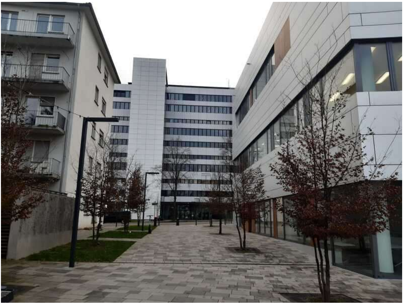
Building 11 from the library